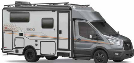
RAW SIENNA WITH GRAPHICS