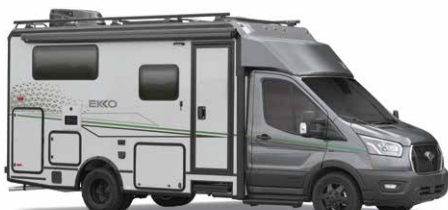
VERDANT WITH GRAPHICS